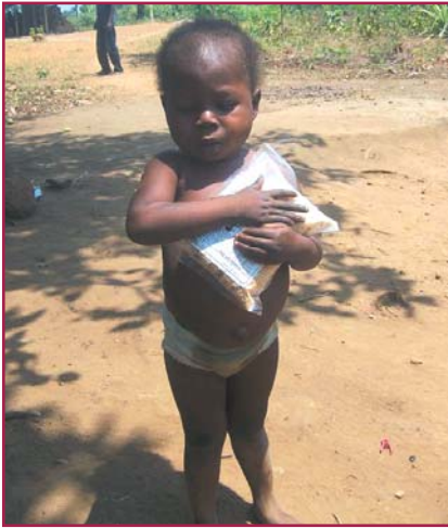
continued from Page 1